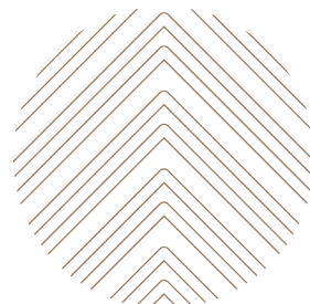
Kia Māia Having courage